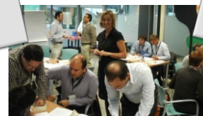
Table 3 – What are the skills required by a multicultural team leader?

Table 2 - What's good about multicultural teams?